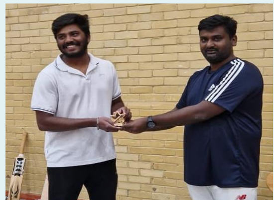
The pictures of presentation of trophy to winner of CTS indoor tournament & to the player of the tournament (Left to right).

The CTS team has planned to register with the CCA to take part in the midweek/Sunday league games and also has plans to conduct another tournament for winter. Please contact events.camtsuk@gmail.com for further enquiries with subject 'Cricket'.