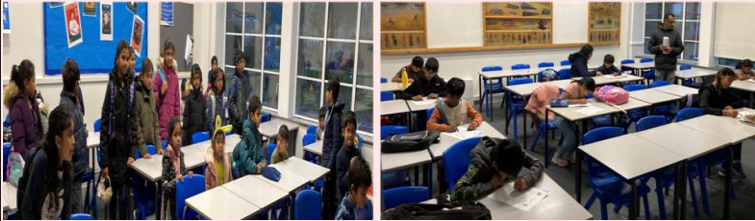
The picture shows the Tamil teachers who provide invaluable support to the school in the top panel. The bottom panel shows school students gathered for attendance followed by assembly and a batch of students supervised during their mid-term examinations (Left to right).